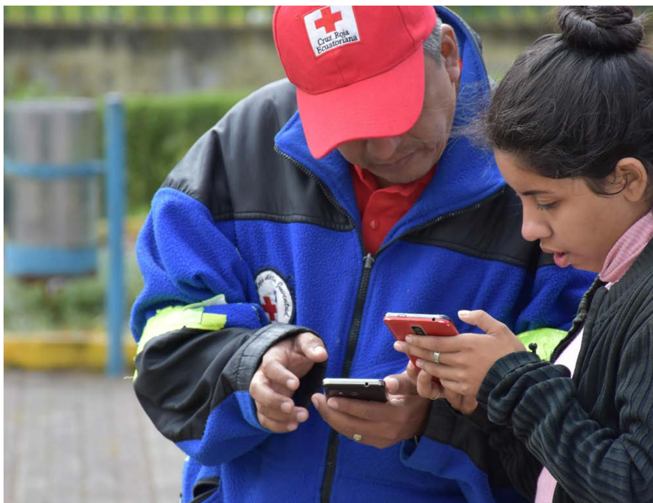
The Ecuadorian Red Cross (ERC) provides support to migrants who pass through the northern border of Ecuador.