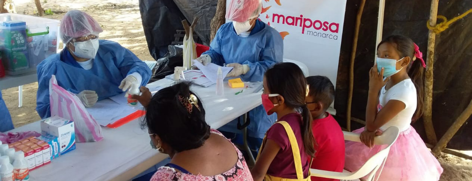
Community work day in the Wawatamana settlement in the municipality of Maicao, in support of 37 families with nutritional health care for 78 children. In addition, 30 adults participated in spaces for the dissemination of rights and protection, gender and inclusion activities.