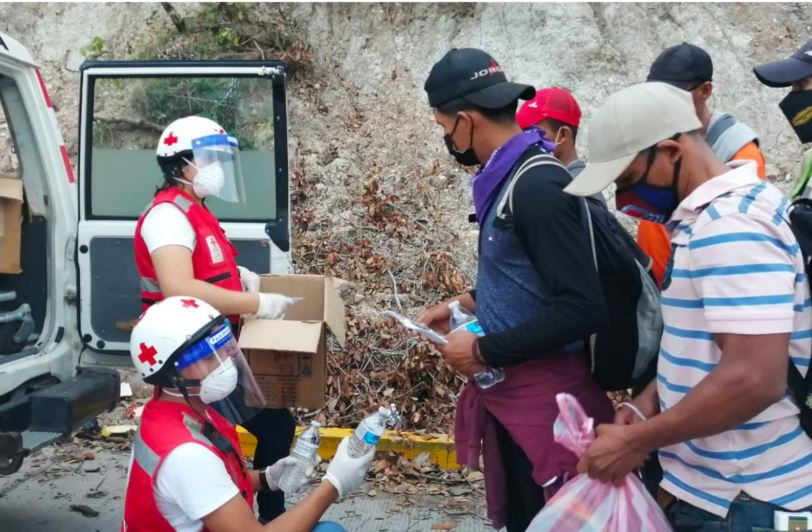
The Red Cross is preparing to provide humanitarian assistance to migrants ready to depart Honduras for Guatemala as part of a 'migrant caravan'. More than 4,000 thousand people are expected to join the caravan that will depart from the Honduran city of San Pedro Sula today.