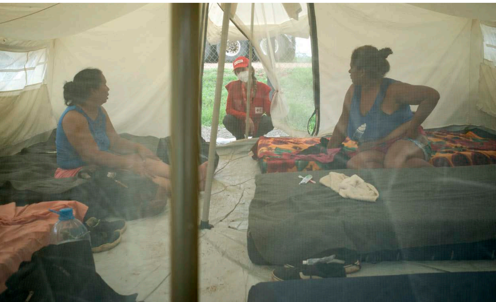
Lajas Blancas Temporary Shelter for Migrants, Darien, Panama.