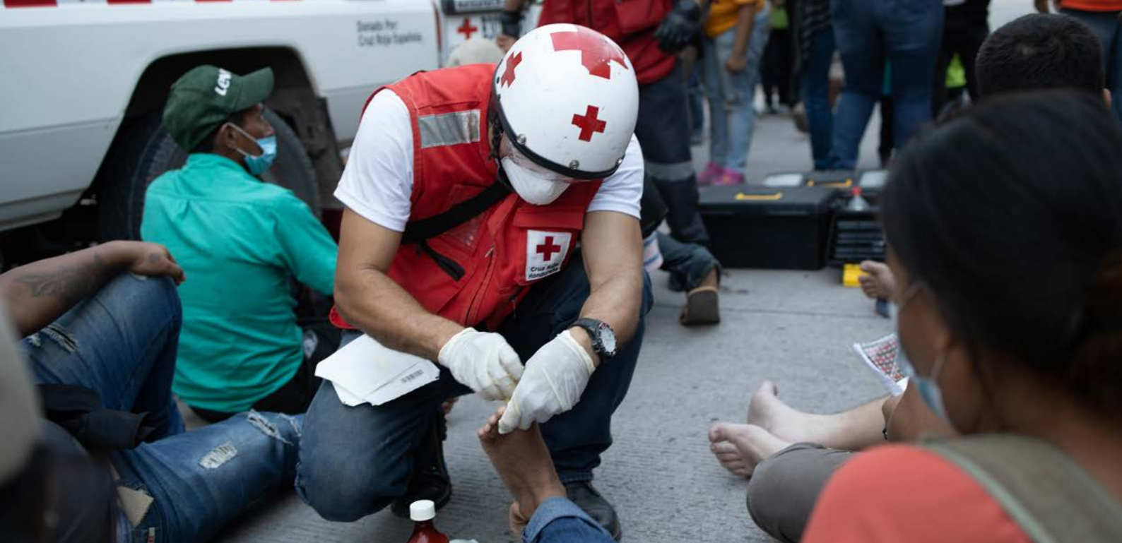
Medical services offered by the Red Cross to migrants in Honduras